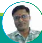
Sidana Supply Chain Manager

ProPak India offered us an incredible range of packaging options, from tin to box packaging, helping us explore solutions to present our products more effectively. This event is a must-attend for packaging professionals, showcasing innovations that inspire and drive better branding strategies.